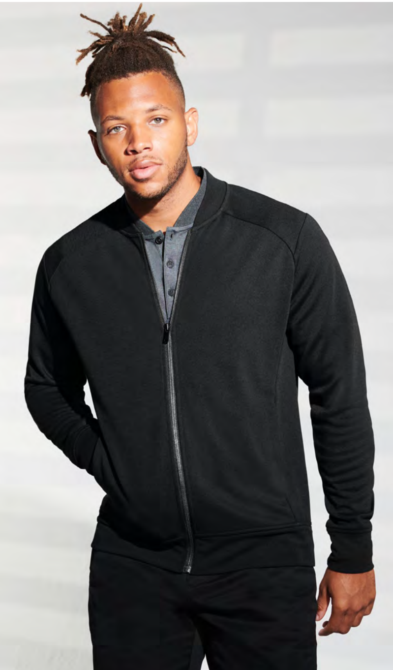
DOUBLE-KNIT BOMBER MM3000