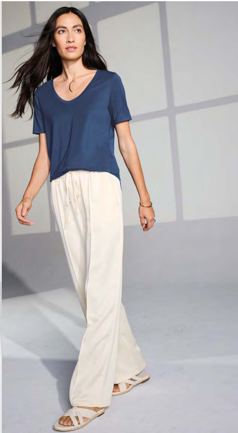
WOMEN'S STRETCH JERSEY RELAXED SCOOP