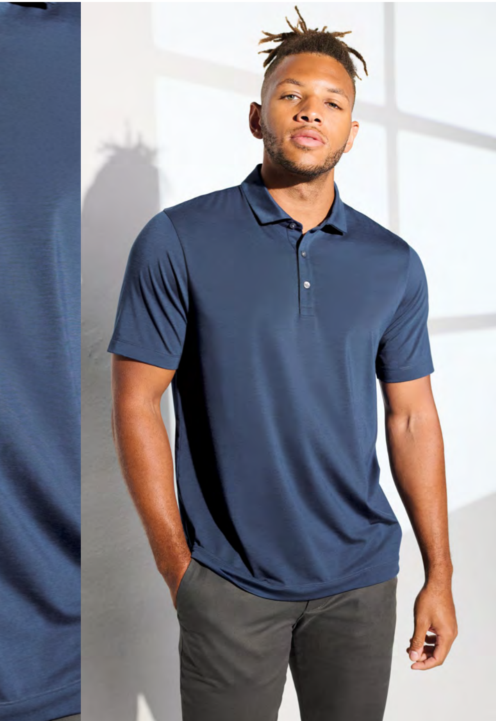
STRETCH JERSEY POLO