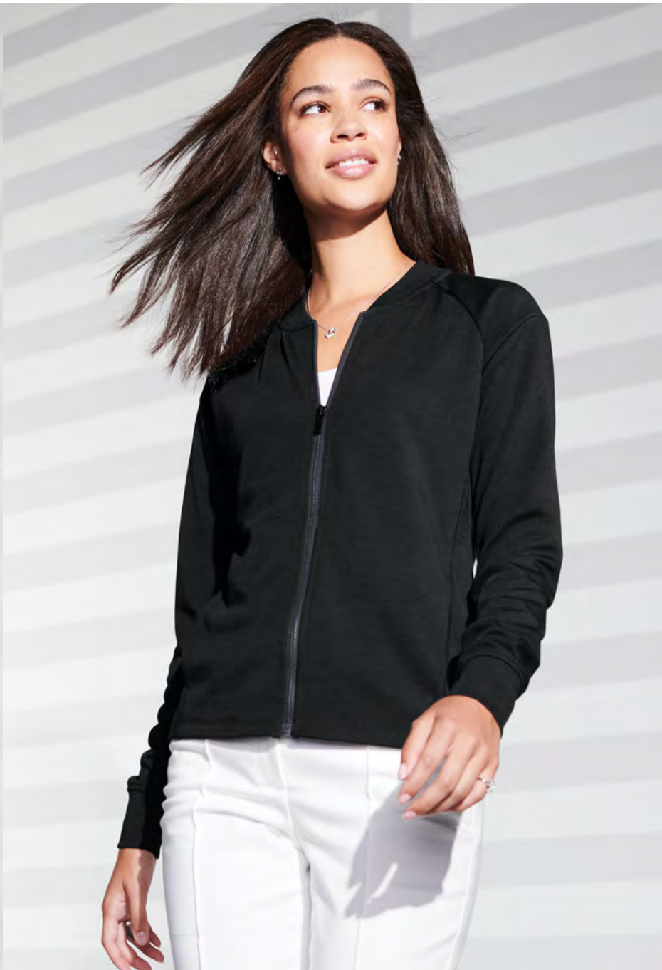
WOMEN'S DOUBLE-KNIT BOMBER MM3001