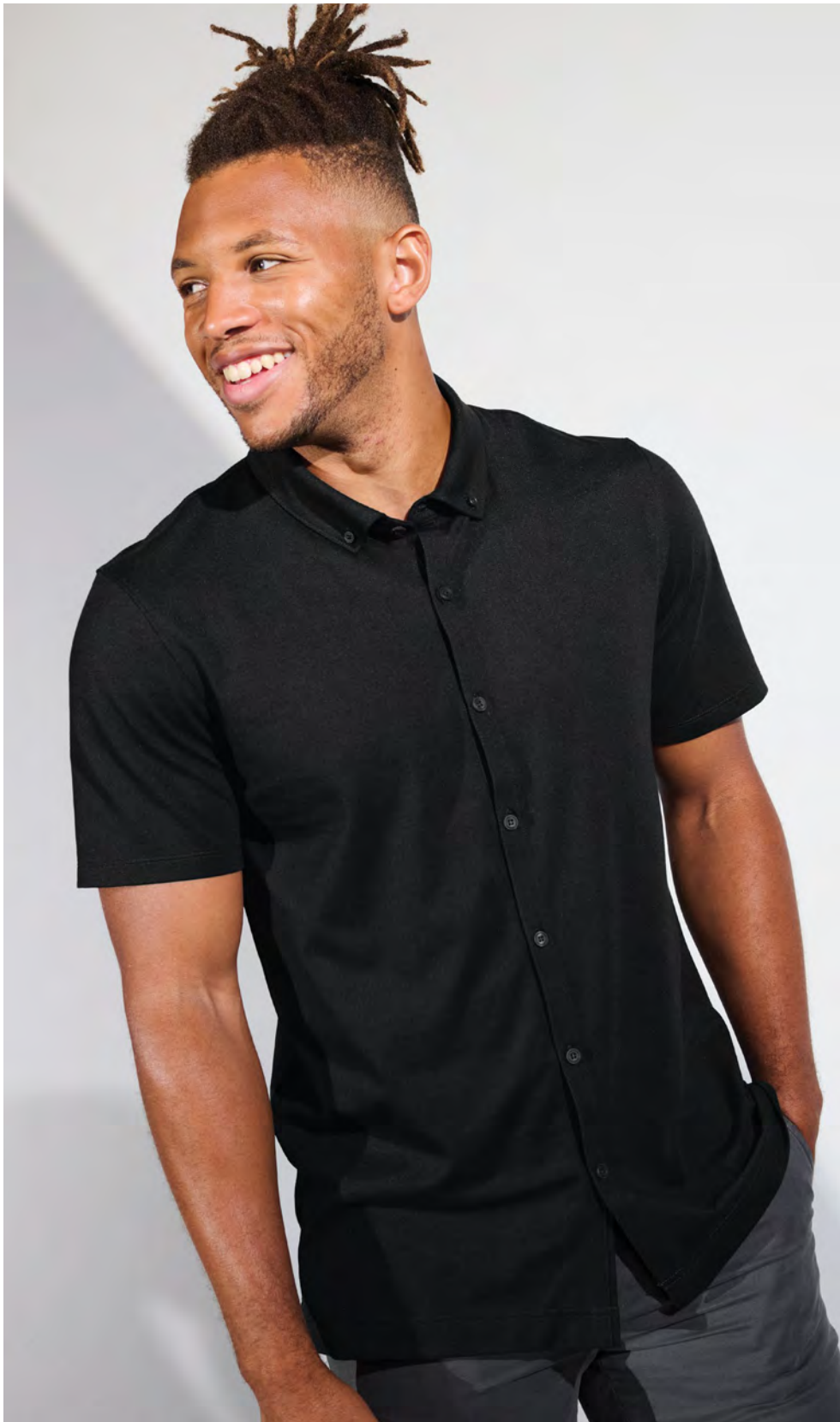
STRETCH PIQUE FULL-BUTTON POLO