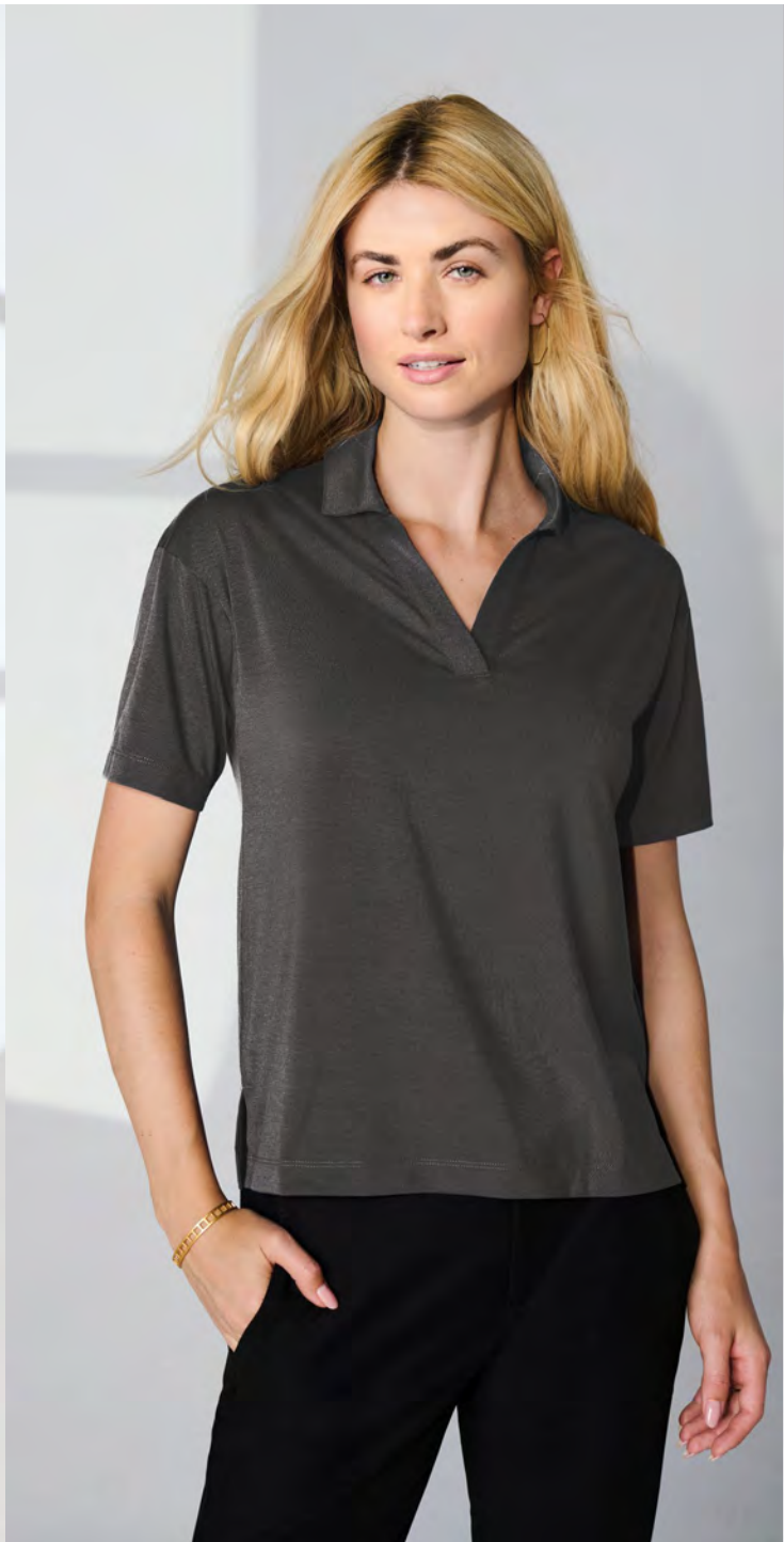
WOMEN'S STRETCH JERSEY POLO