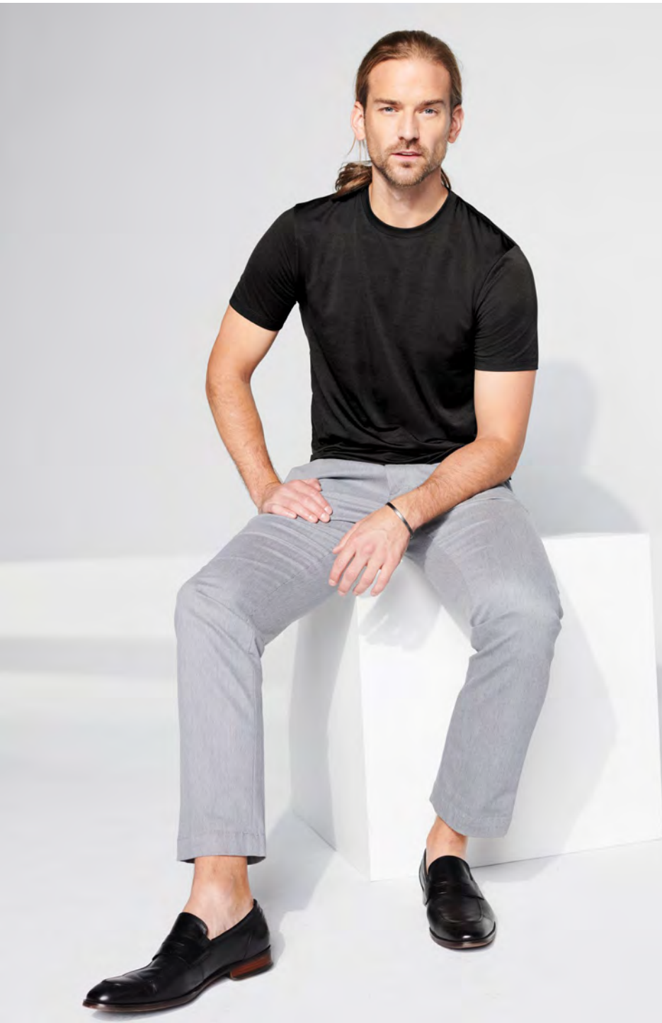
STRETCH JERSEY CREW