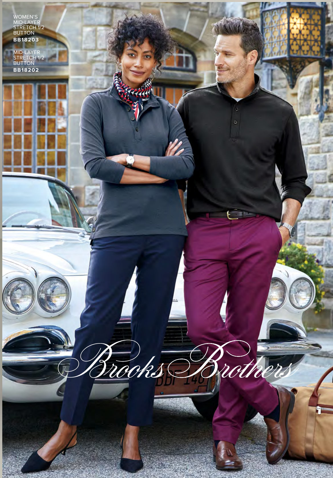
MID-LAYER STRETCH 1/2 BUTTON BB18202