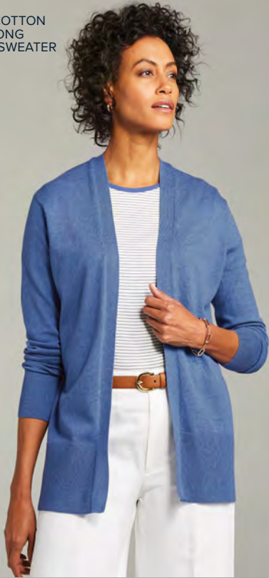
WOMEN'S COTTON STRETCH LONG CARDIGAN SWEATER BB18403