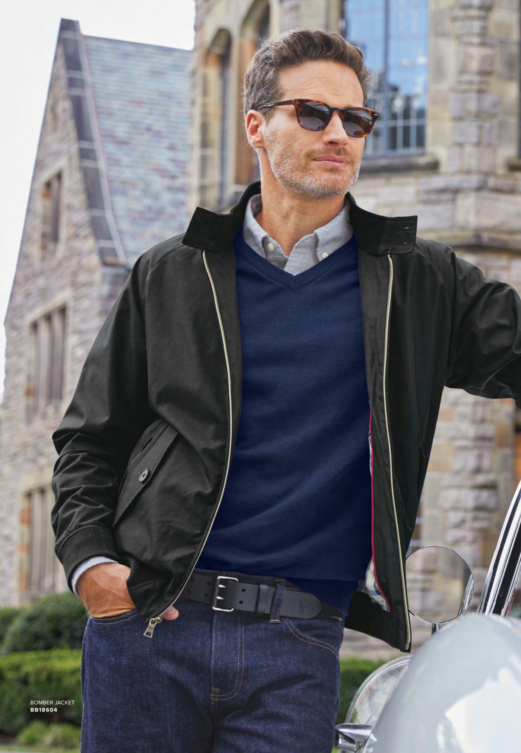
BOMBER JACKET BB18604