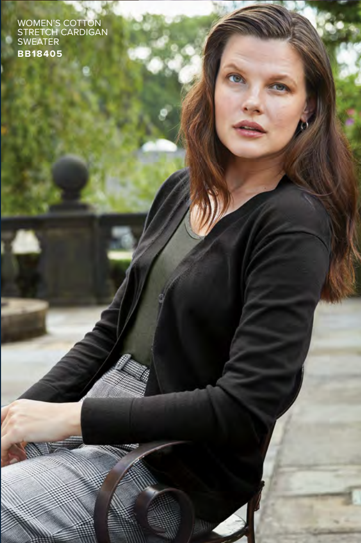
WOMEN'S COTTON STRETCH CARDIGAN SWEATER BB18405