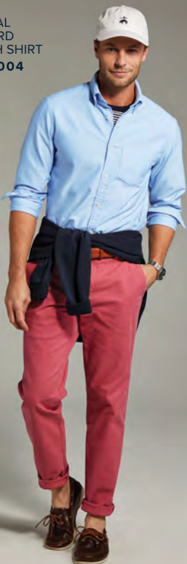
CASUAL OXFORD CLOTH SHIRT BB18004