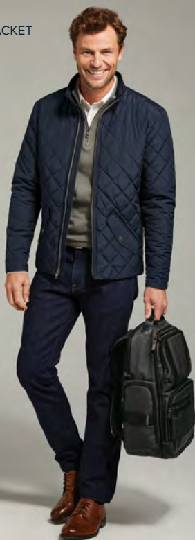
QUILTED JACKET BB18600