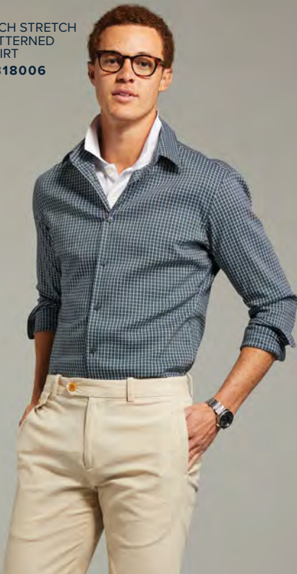
TECH STRETCH PATTERNED SHIRT BB18006