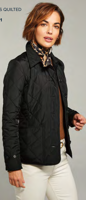
WOMEN'S QUILTED JACKET BB18601