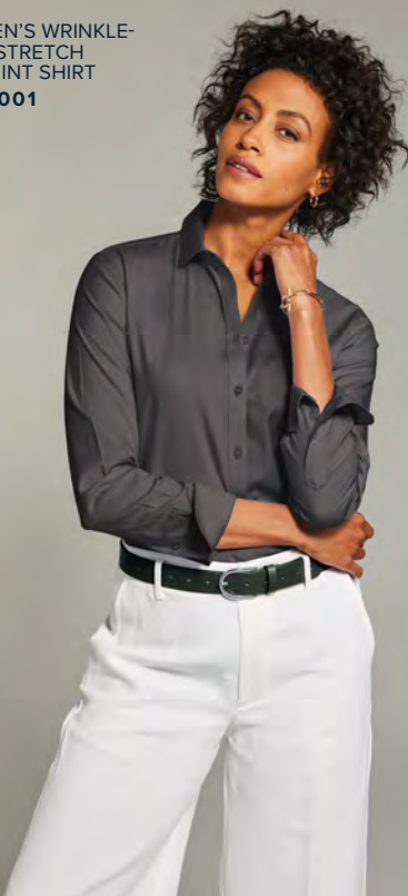
WOMEN'S WRINKLE-FREE STRETCH PINPOINT SHIRT BB18001