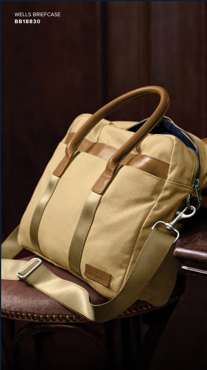
WELLS BRIEFCASE BB18830