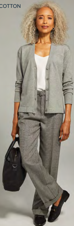
WOMEN'S COTTON STRETCH CARDIGAN SWEATER BB18405