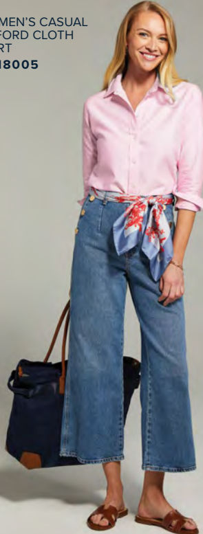
WOMEN'S CASUAL OXFORD CLOTH SHIRT BB18005