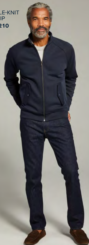
DOUBLE-KNIT FULL-ZIP BB18210