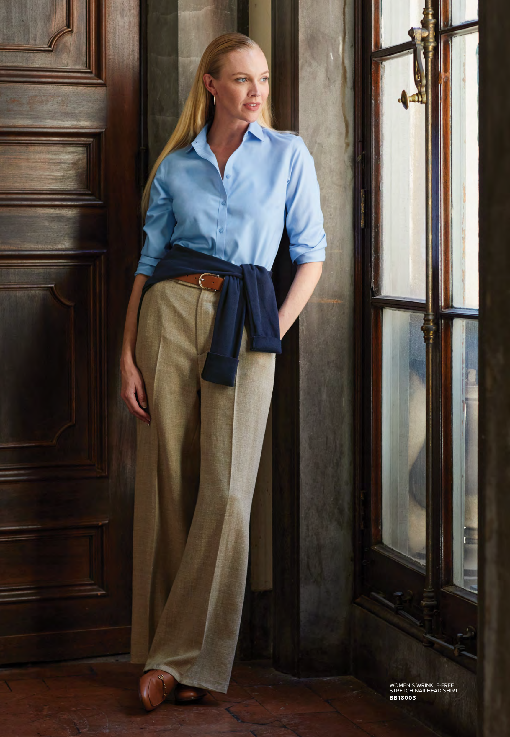
WOMEN'S WRINKLE-FREE STRETCH NAILHEAD SHIRT BB18003