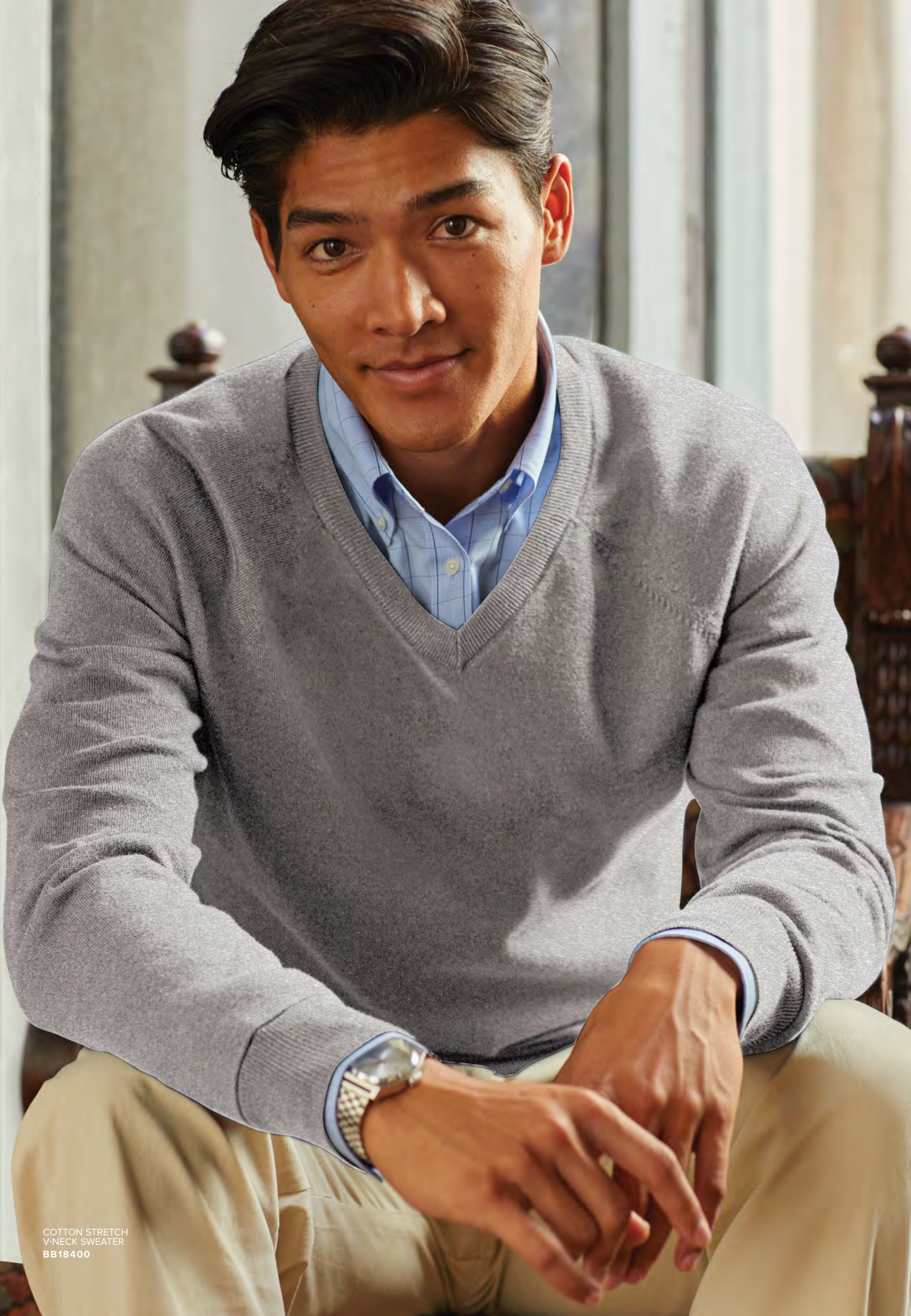
COTTON STRETCH V-NECK SWEATER BB18400