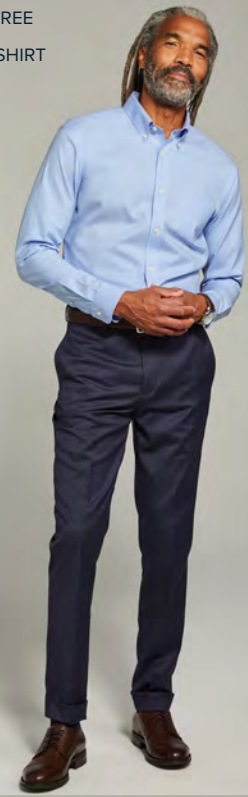
WRINKLE-FREE STRETCH PINPOINT SHIRT BB18000