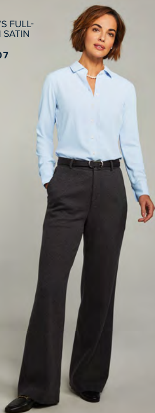
WOMEN'S FULL-BUTTON SATIN BLOUSE BB18007