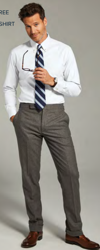
WRINKLE-FREE STRETCH NAILHEAD SHIRT BB18002