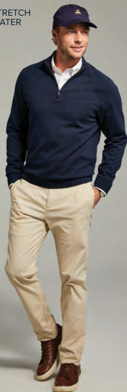
COTTON STRETCH 1/4-ZIP SWEATER BB18402