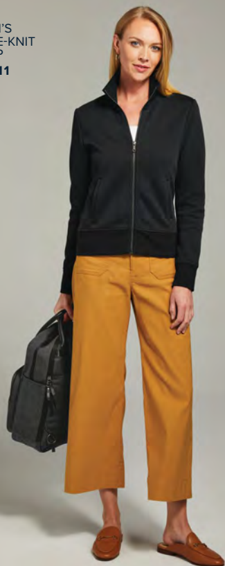
WOMEN'S DOUBLE-KNIT FULL-ZIP BB18211