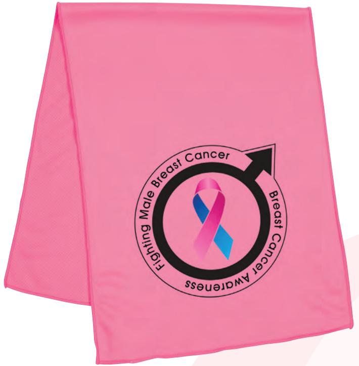
#7856 SUPER DRY COOLING TOWEL · Made Of 100% Soft Polyester With MeshLike Construction · Quick-Absorbing And Quick-Drying · Reusable · For Non-Medical Use · Stock Design Shown: PinkAwareness_24 As Low As $2.59(c)