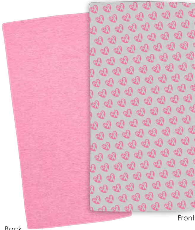
#7854 - 12" X 24" DYE SUBLIMATED MICROFIBER TOWEL · 200 GSM Microfiber · Full 4CP Dye Sublimated Image On Front With Colored Heathered Back · Stock Design Shown: PinkAwareness_7 As Low As $4.49(c)