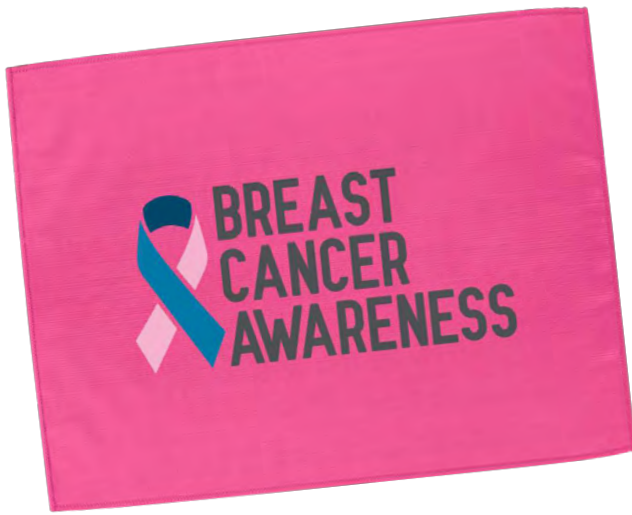
#6088 - 15" X 18" MICROFIBER RALLY TOWEL · 225 GSM Polyester Microfiber · Cotton Alternative With Cotton Feel · Serge Hem · Stock Design Shown: PinkAwareness_17 As Low As $2.09(c)