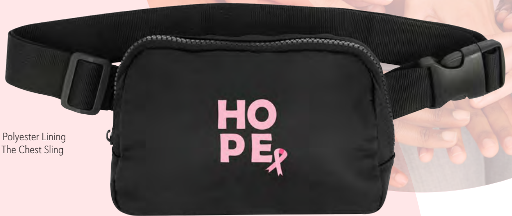
#4204 Built-In Slot For Earbuds