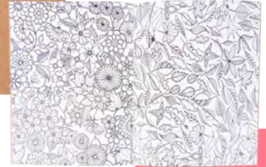
Sample Inside Page