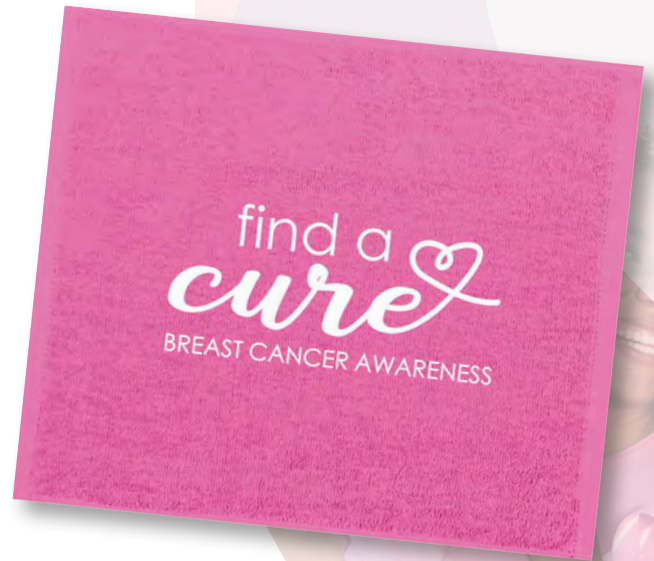
#6080 RALLY TOWEL · Great promotional Product For Giveaways, Promotions Or Just For Fun! · 100% Cotton Terry Cloth · Not Colorfast, Wash Separately In Cold Water · Stock Design Shown: PinkAwareness_21 As Low As $2.49(c)