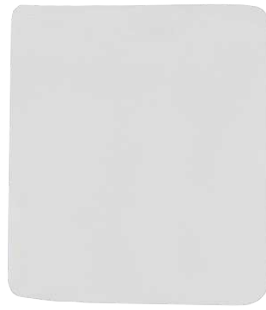
Folds Into Pouch